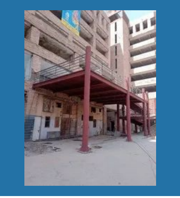
Iron Mezzanine Floor