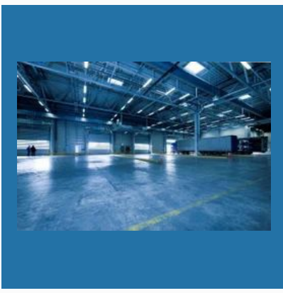
Industrial Fabrication Service