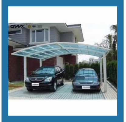
Car Parking Shed