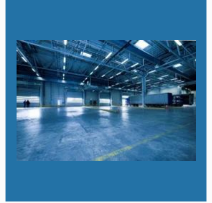
Tin Shed Fabrication Services