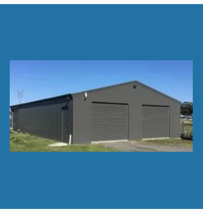
Car Parking Tensile Structure