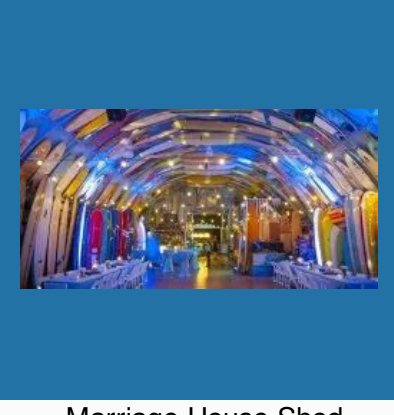
Marriage House Shed