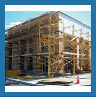
Prefabricated Turnkey Project