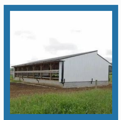
Poultry Farm Sheds