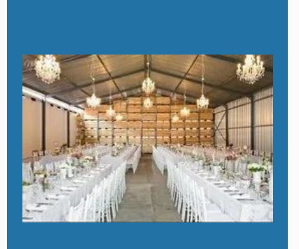
Banquet Hall Shed