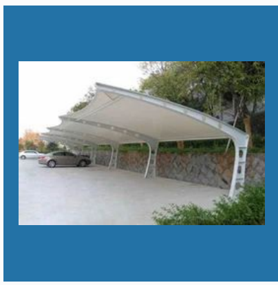
Parking Shed Fabrication