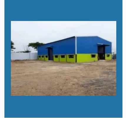
Commercial Building Construction Services