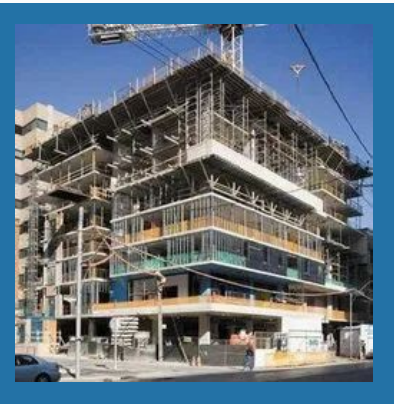
Commercial Turnkey Projects